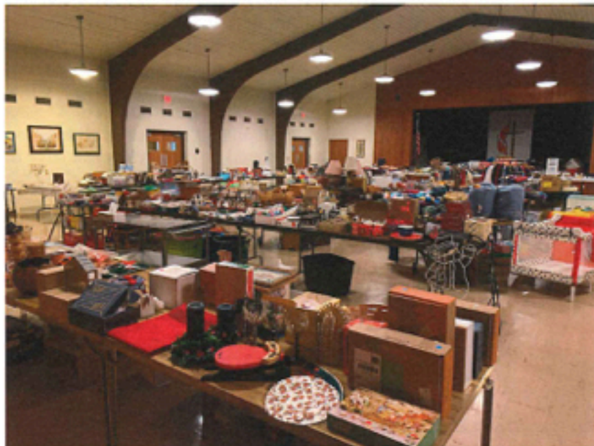
Proceeds will benefit Claire's Critter Closet and UWIF Missions Projects