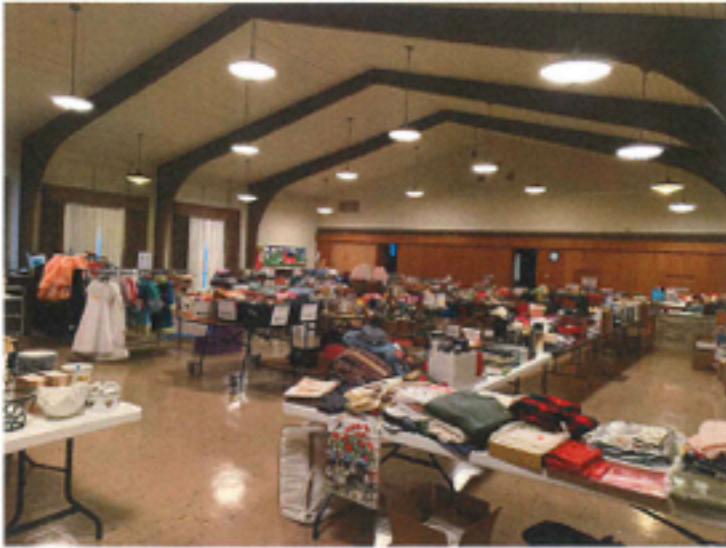
Fall Rummage Sale held by the United Women in Faith October 28th & 29th.